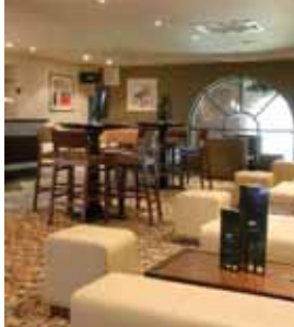
The Woodland Restaurant